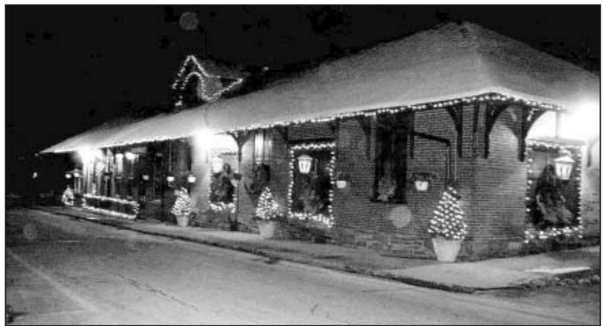
Weatherly's Borough Building is the site of evening carolling all this week leading up to Christmas in the Park.